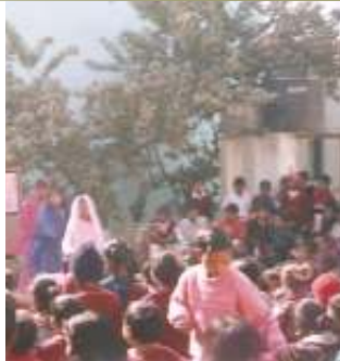
A dance of celebration

different centres celebrated with skits, songs, and dances. The assembled guests also joined in the celebrations. A day of national pride and of joyous enthusiasm Jai Hind