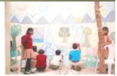
A mural on the way...

ting brushstrokes on the wall. The mural was finished in two days and continues to add colour and a sense of joy to