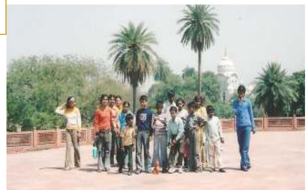
Students of the remedial classes at the Humayun's Tomb

On Christmas day , some of our students had their first experience of a Christmas carnival. It was a day of fun and frolic for our students at the Habitat Centre. The children had a great time playing games and feasting on goodies.