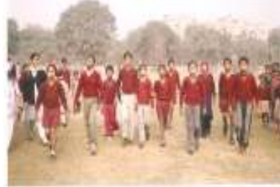
the Spoon and Lemon Race

merriment they took part in some field and track events. What better way to end such a morning but by generous helpings of hot samosas and jalebis.