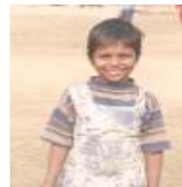
Ruby is all SMILES

To give an incentive to the families to continue with the education of their girls, the students enrolled in this project also receive monthly gifts of dry rations or hygiene products which benefits the entire family.