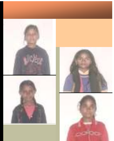
With hope in their eyes