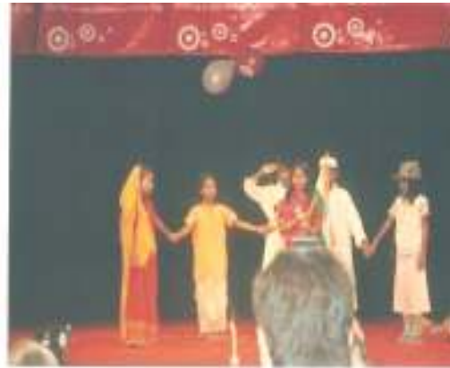
A skit on national integration

With the fund SShrishti launched SShrishti Ladli for the tiny tots of migrant labourers. The project offers special privileges to the girl child to promote their education. We thank