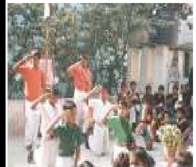
“ Maa tujhe Salam “