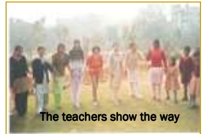
The teachers show the way